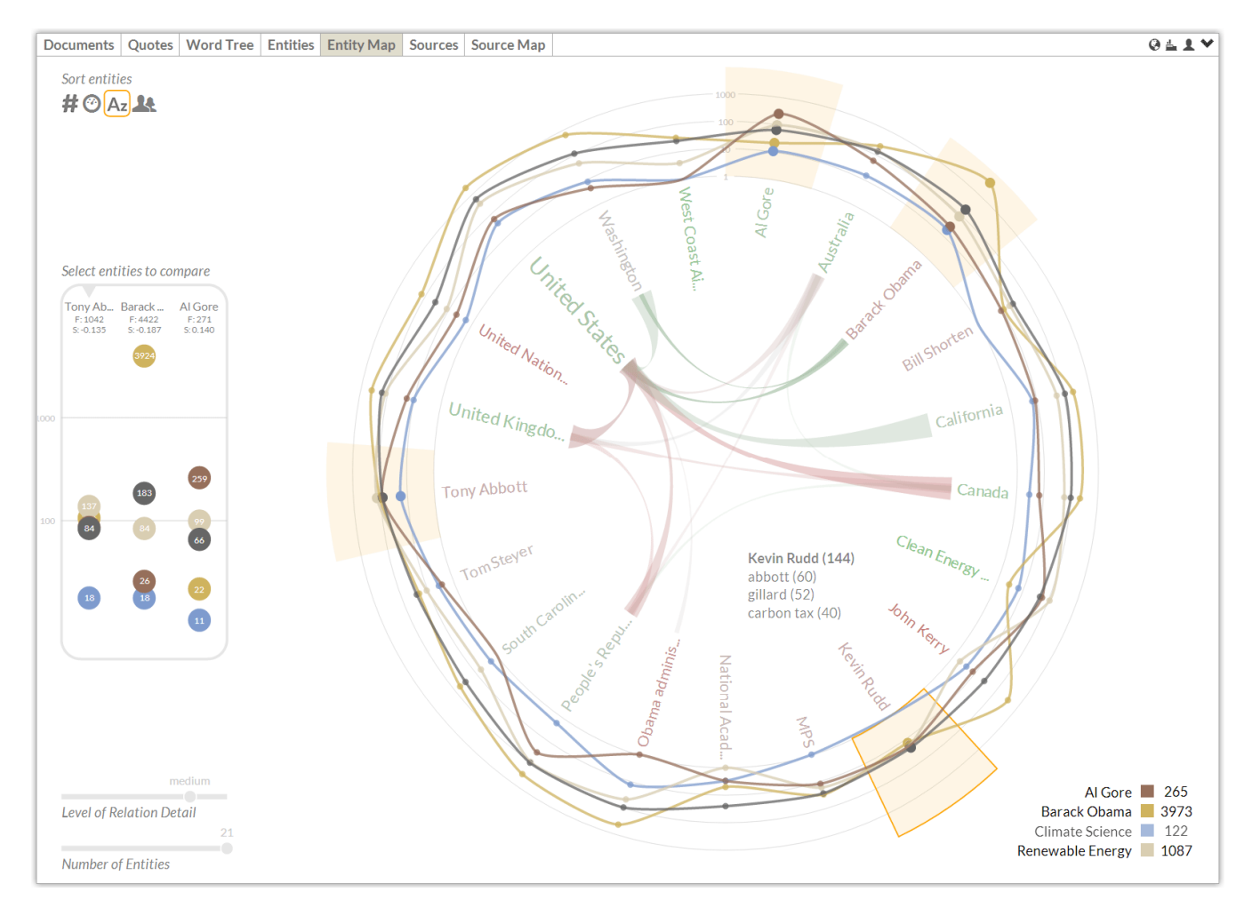
Figure 4. Entity Map showing the co-occurrence frequency of the search terms "Al Gore", "Brarack Obama, ", "Climate Science" and "Renewable Energy" with identified named entities (organizations, persons and locations), as well as the strength of the relations among these entities

Three small icons in the upper right corner control which entity types are displayed – persons, organizations and locations (of which at least one needs to be active). Clicking on an icon in the upper left corner causes the entities to be rearranged by (i) entity type, (ii) name, (iii) the number of documents which contain an instance of the entity's name in descending order, or (iv) the average sentiment of the documents containing the entity, from positive to negative.