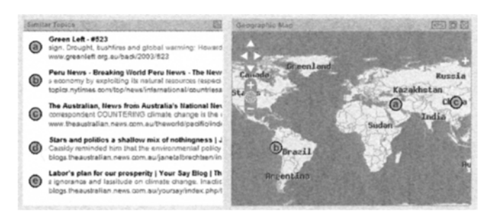
Fig. 2. List of articles related to the term 'vacation' within the geo-referenced archive of the IDIOM Media Watch on Climate Change (www.ecoresearch.net/climate)

search support as shown in Figure 2 – not only considering topical similarity, but also on the location of an information object relative to the user's actual location. Examples include Jobloft.com , which enables users to search for retail jobs, food services jobs and hospitality jobs in their vicinity, and Housingmaps.com to find out the location of apartments and houses via Google Maps.